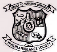
M .H Saboo Siddique Hospital