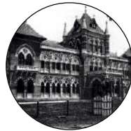
Cama & Albless Hospital